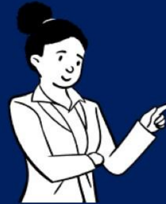
FCA, ICO AND FOS